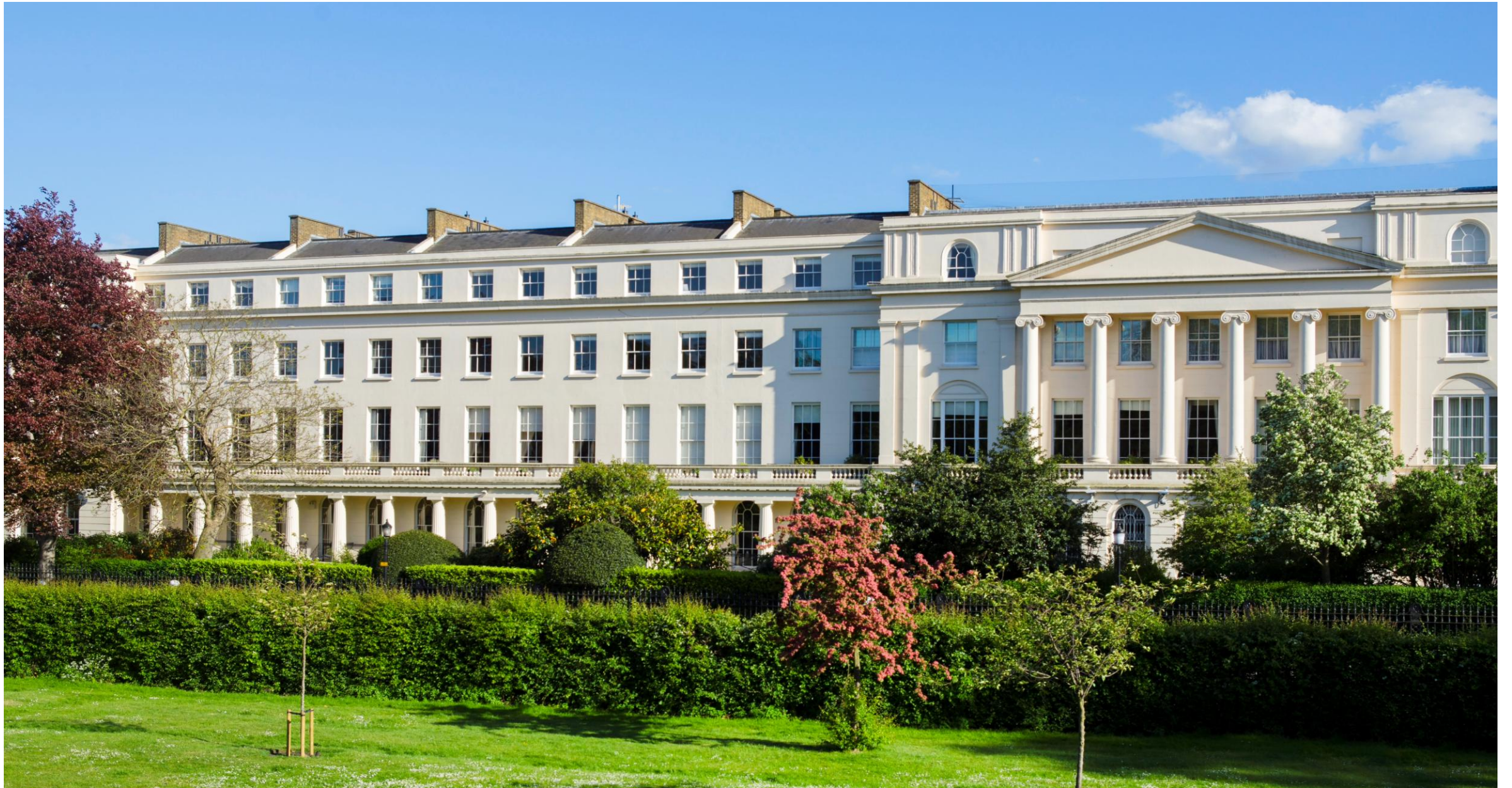
York Terrace West, Regent's Park, NW1