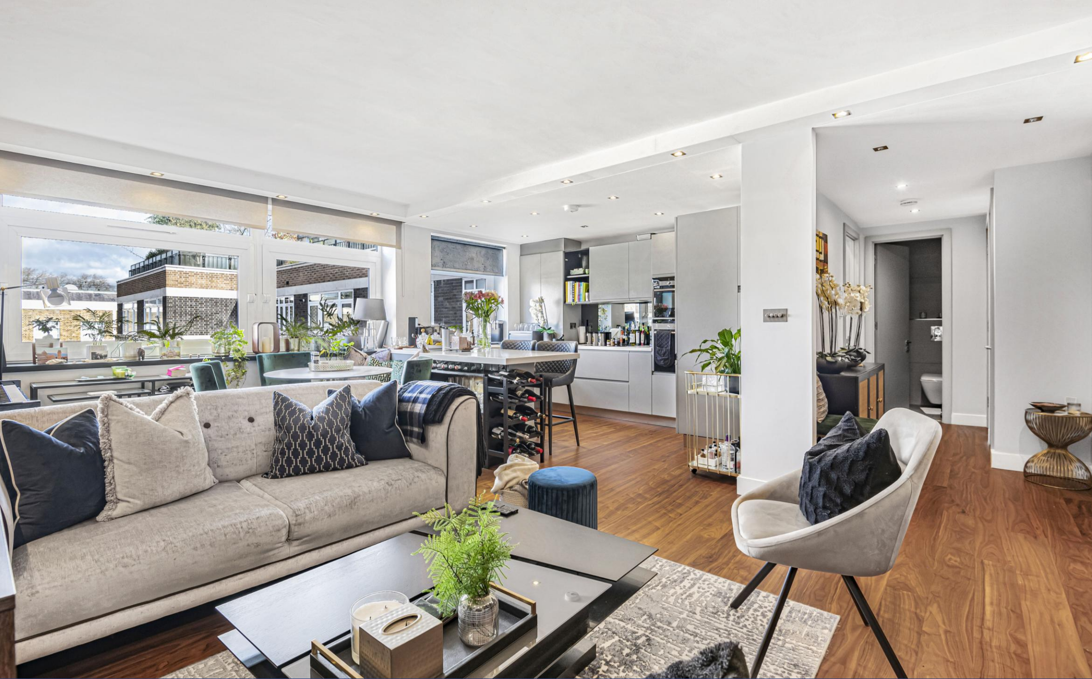
Nottingham Terrace, Regent's Park NW1