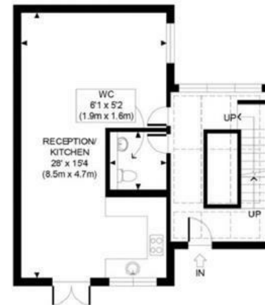
GROUND FLOOR GROSS INTERNAL FLOOR AREA 596 SQ FT

APPROX GROSS INTERNAL FLOOR AREA 1875 SQ FT / 174 SQM