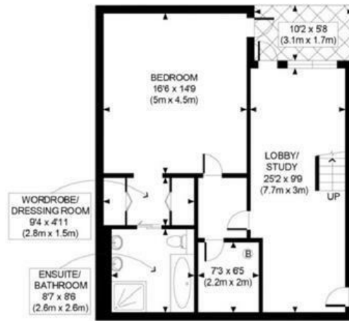
BASEMENT GROSS INTERNAL FLOOR AREA 711 SQ FT