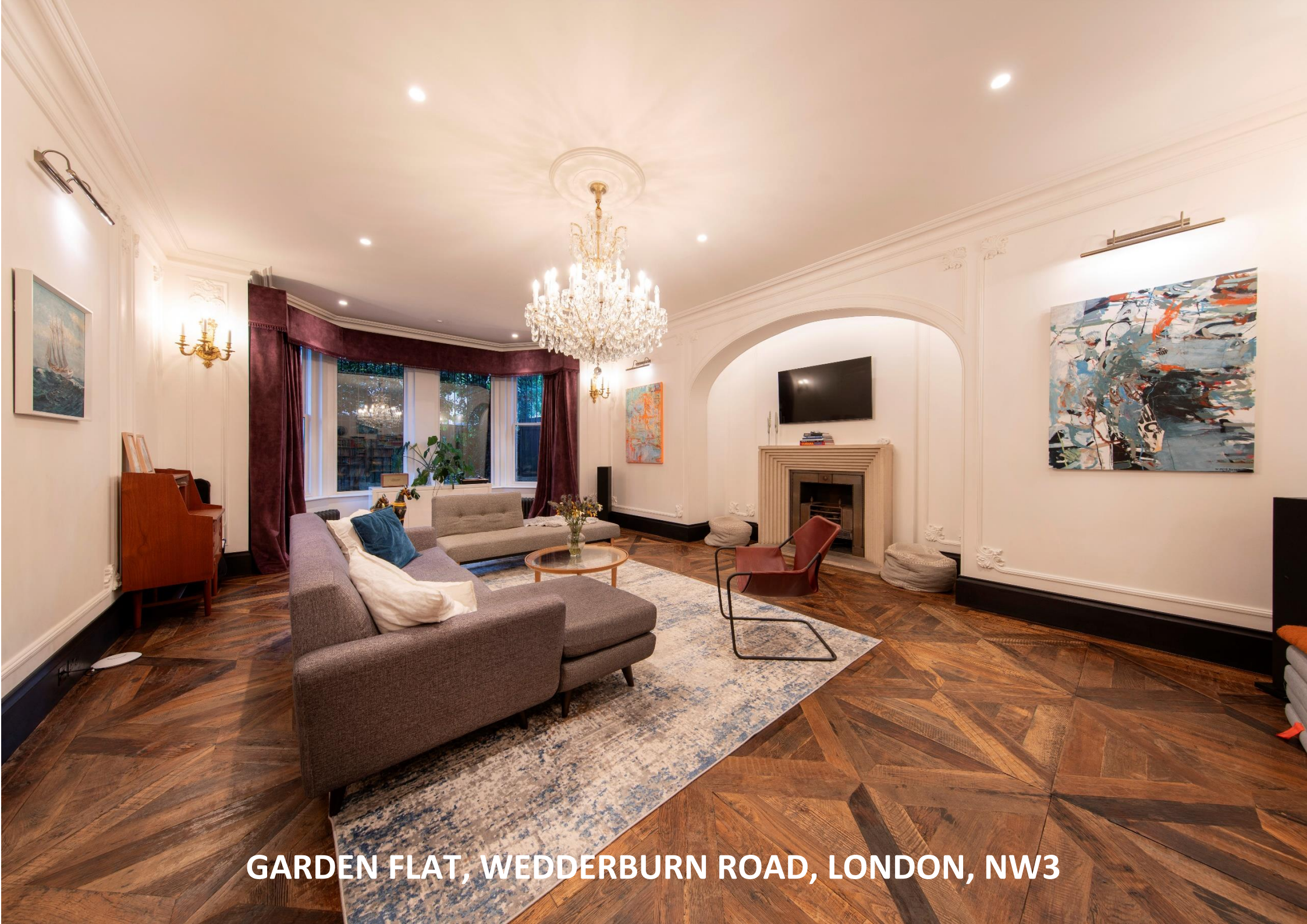
GARDEN FLAT, WEDDERBURN ROAD, LONDON, NW3