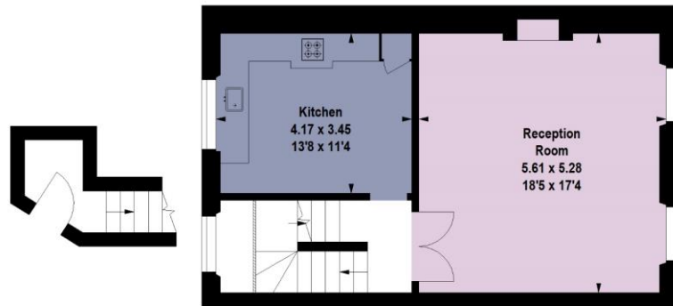
First Floor Entrance