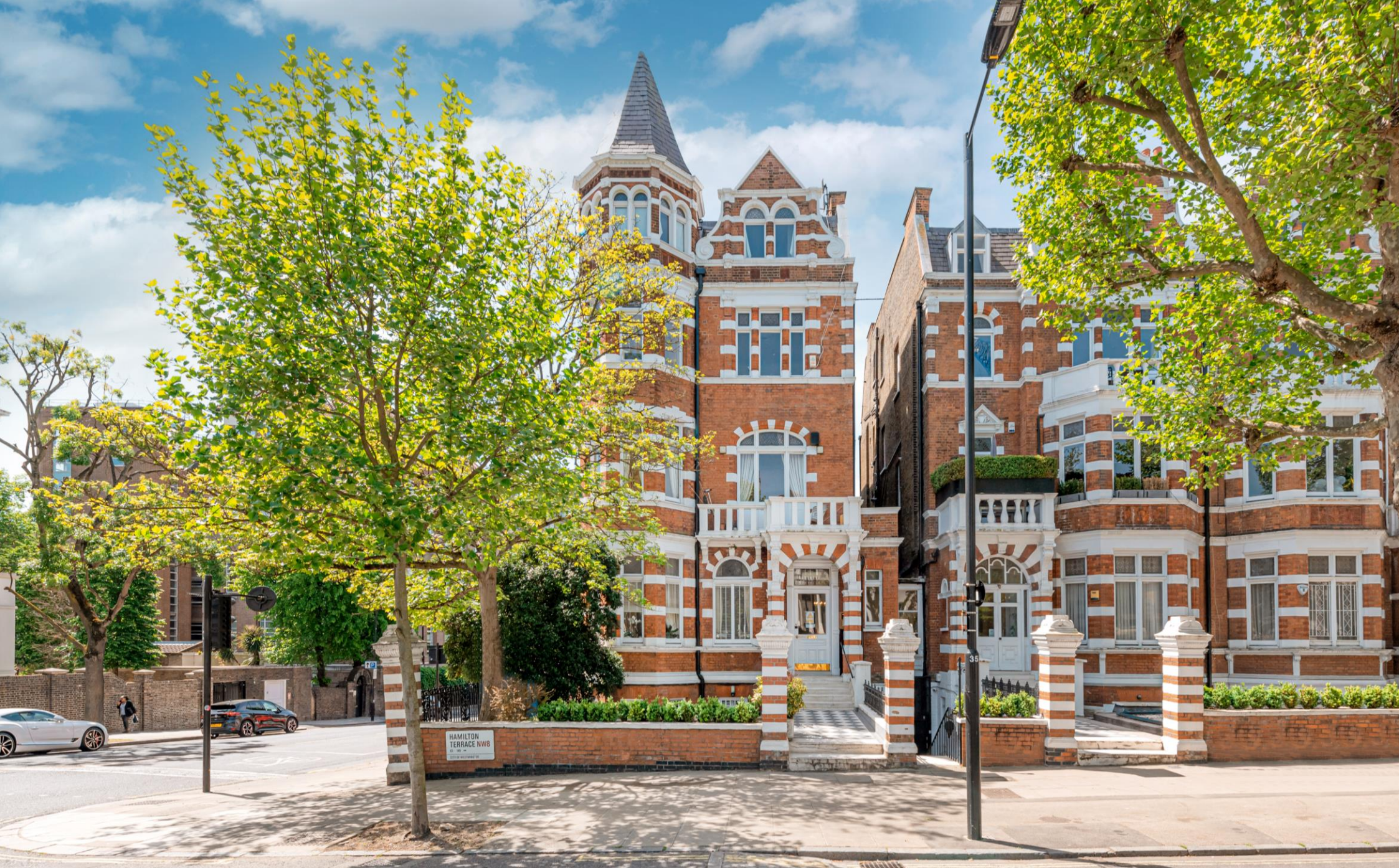
Hamilton Terrace, St John's Wood NW8