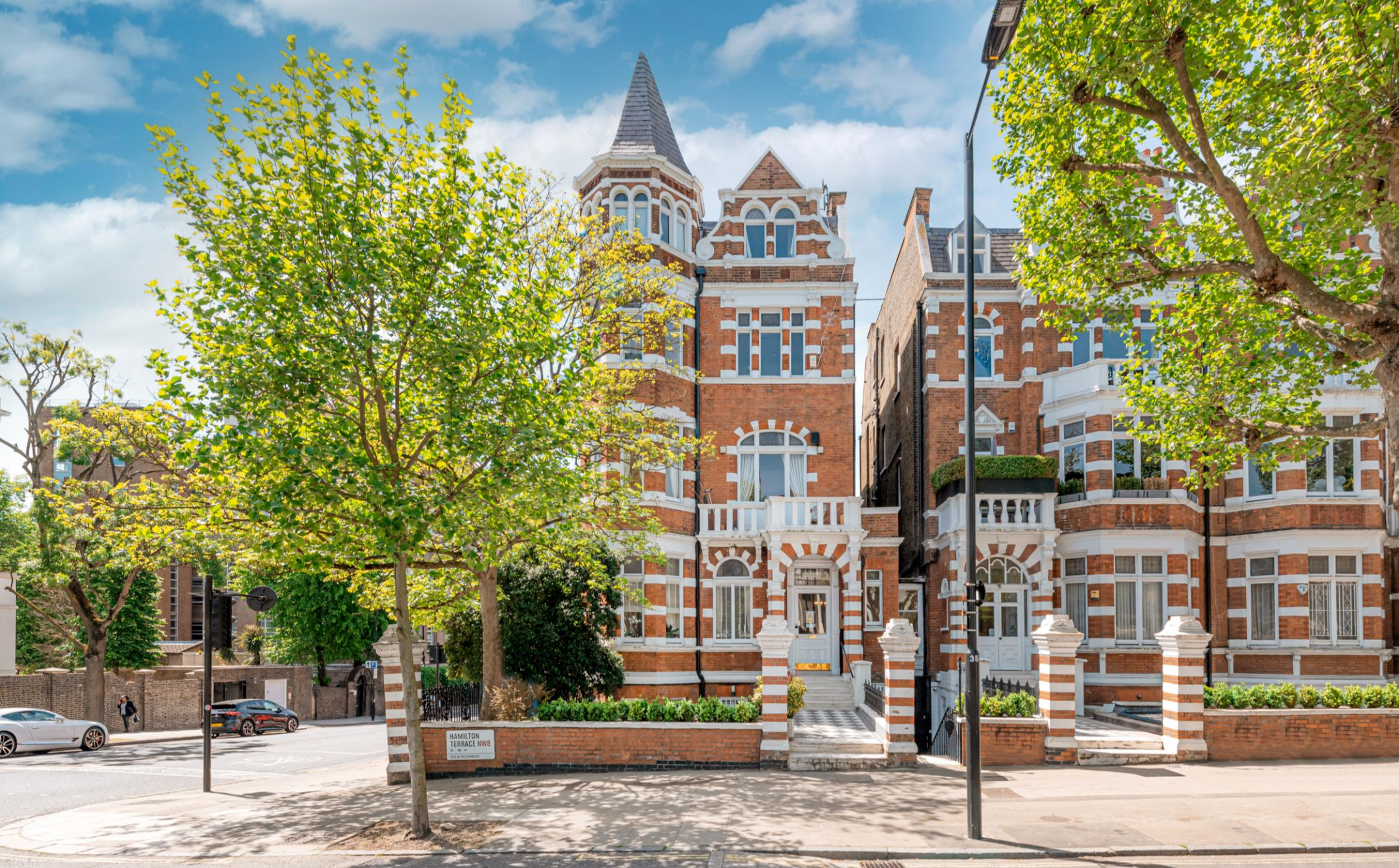
Hamilton Terrace, St John's Wood NW8