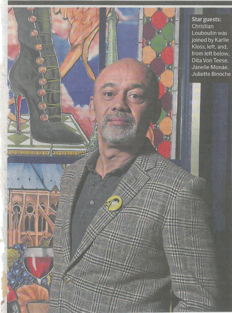
Star guests: Christian Louboutin was joined by Karlie Kloss, left, and, from left below, Dita Von Teese, Janelle Monáe, Juliette Binoche

After recording at Abbey Road Studios, The Beatles would hang out in the top-floor music room with its psychedelically painted piano where hits such as Penny Lane and Hey Jude were written.